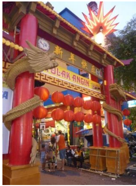
Figure 1 Decorations during the Lunar New Year. Yogyakarta 2010.