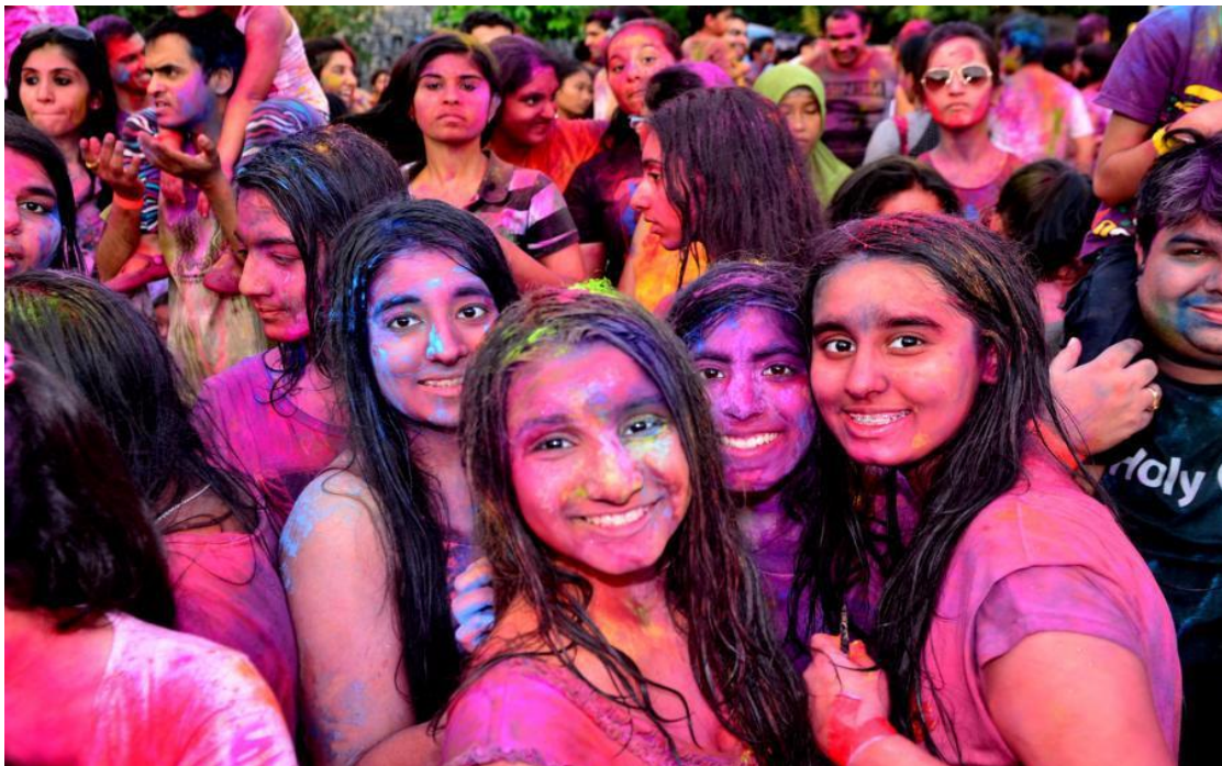
Figure 5 Festive crowd during the Holi celebration 2013.

Food booths had both vegetarian and non-vegetarian options. Along with Indian snacks and dishes ( samosa , chicken tikka , Mysore mutton), the guests could indulge themselves in Indonesian street food, such as soto , sate and gorengan , Hong Kong noodles, Italian focaccia, American burgers and Cream and Fudge ice cream. 23 The kiosks selling beverages offered both non-alcoholic and alcoholic beverages, but bhang lassi , a yoghurt drink mixed with cannabis leaves, a common, even traditional, element of Holi celebration in India, was not offered in Jakarta.