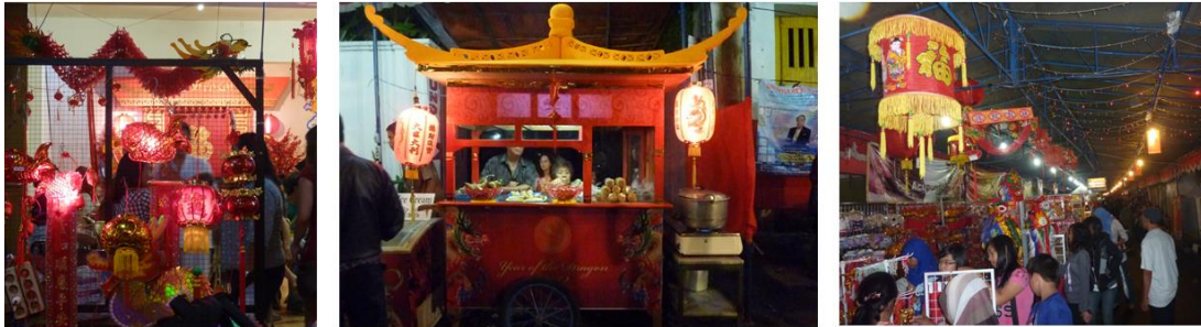
Figure 4 Decorations during the Lunar New Year

Pekan Budaya Tionghoa Yogyakarta (Chinese Indonesian Culture Week, henceforth PBTY) is the main event of the public Chinese New Year celebration in Yogyakarta. In 2012 the PBTY took place in Kampung Ketanden . While not popular among tourists throughout the year, Kampung Ketanden , the main residence of Chinese Indonesians in Yogyakarta, turns into a busy area during the celebration. The entrance gate of the Kampung , decorated for the special occasion, easily captures the attention of passers-by, inviting them to dive into a festive atmosphere of Chinese New Year. No admission fees are imposed on the visitors.