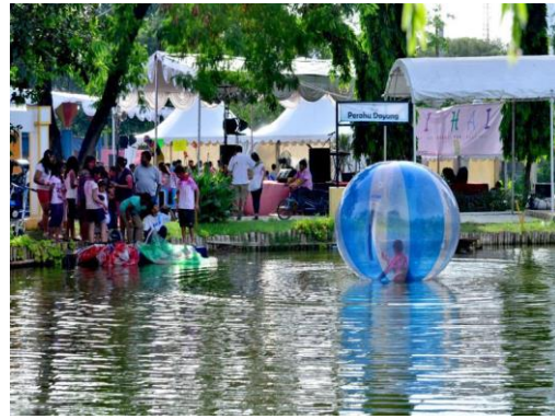
Figure 2 The Celebration of Holi. Kemayoran, Jakarta 2013.

In Yogyakarta, the celebrations of Imlek , the Chinese Lunar New Year, seem to be omnipresent and closely linked to the Chinese Indonesian community. Banners and advertisements displaying the Mandarin words Gong Xi Fa Cai (literally wishing wealth, but commonly used as New Year's greeting) can be observed all over the city. Every shopping mall is dipped in shining combinations of red and gold. 1 The heart of the celebrations is Pekan Budaya Tionghoa 2 Indonesia (Chinese Indonesian Culture Week), a fair lasting several days, and a closing parade, featuring Barongsai (Lion dance) and Liong (Dragon dance) performance groups. Both events are highly visible in public: the festive events take place near Jl. Malioboro, the main shopping street in Yogyakarta, and are easily accessible to a large number of spectators as there are no entrance restrictions.